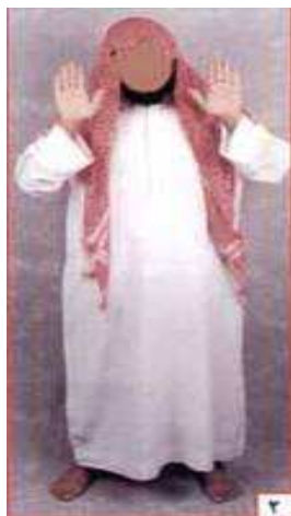
Standing Facing Qiblah and Making Takbeer with Raised Voice

3. Place the right hand over the left on the chest. Look at the place of prostration without lowering your head.