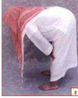
Bowing ( rukoo' ) Position in Salah

(iii) While in bowing position one says: