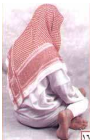
Tawarruk Position -

In the prayers of the three or four rak'ah type, after finishing the second rak'ah and the first tashahhud , stand up raising your hands (as described earlier) and say, "ALLAAHU AKBAR." When you reach the straight standing position, recite the Faatihah and go for the prostrations as done earlier. If you are praying the three rak'ah prayer of Maghrib sit with your body resting on your left thigh, your left leg under your right, while keeping your right foot upright. This position is called tawarruk :