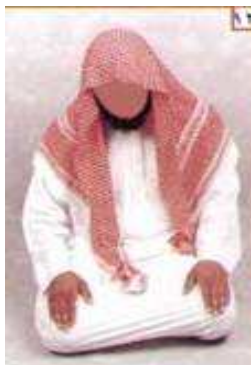
The left and right foot in IFTIRASH