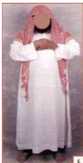
Hands on the Chest; Right Hand over the Left

3. Place the right hand over the left on the chest. Look at the place of prostration without lowering your head.