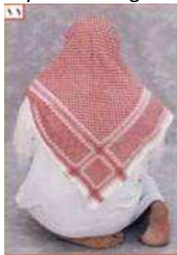
Sitting Position -